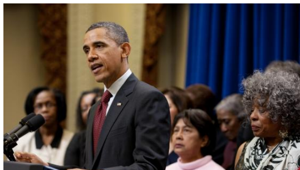
President Barack Obama announces the proposed rule at a White House ceremony, December 15, 2011.

"When this exemption to the FLSA was established in 1974, it was meant to apply to casual work arrangements like babysitting," then U.S. Secretary of Labor Hilda Solis said in 2011, announcing the proposed rule. "It was not intended to cover professionals whose vocation was in-home care service ... Professional caregivers are committed to their jobs. This is truly work from the heart, but it's also hard and demanding. So it's time for us to take better care of our nation's caregivers and provide them with the wage protections that they deserve."